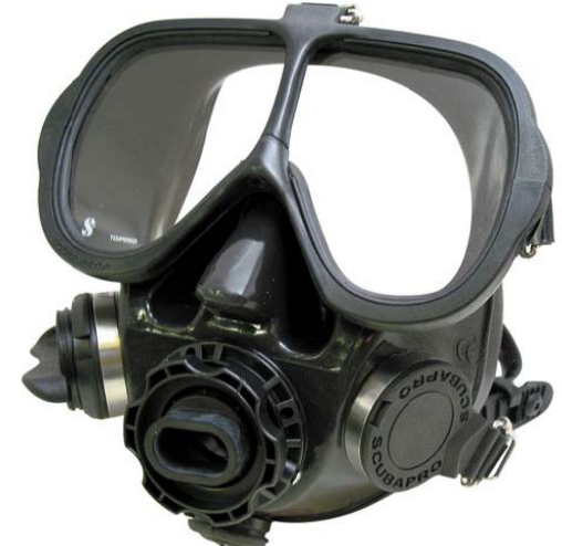
Scubapro Full Face Mask with Blank Port

4. Loop the strap back through the buckle between the two cross bars.