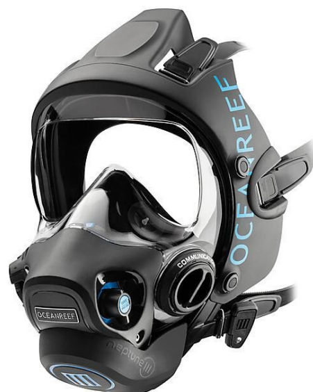
Ocean Reef Full Face Mask with Communication Port

The DIVELINK part “MPC-REEF” is a robust waterproof microphone for the Ocean Reef Full Face Mask. It screws into the Communication port on any model of Ocean Reef Full Face Mask.