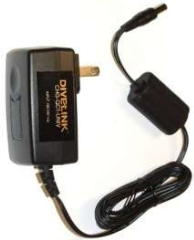
Universal Charger CHG-QC1-UNIV