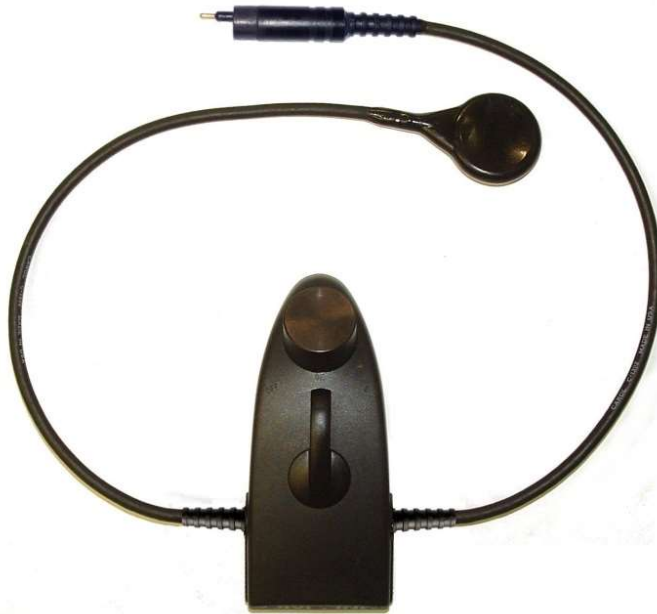
Head Mount Communicator