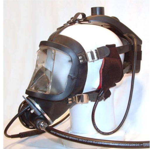
Voice Activated Microphone MPC-AGA shown with AGA Divator Full Face Mask