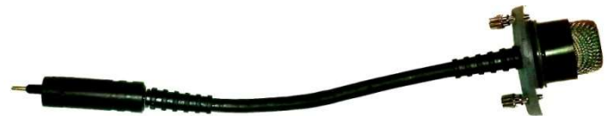
Waterproof Microphone MPC-AGA For AGA Interspiro Microphone Port (Order Separately)