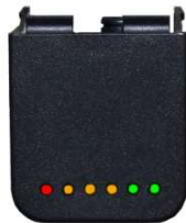
Battery Pack BAT-U01-EM-NIMH