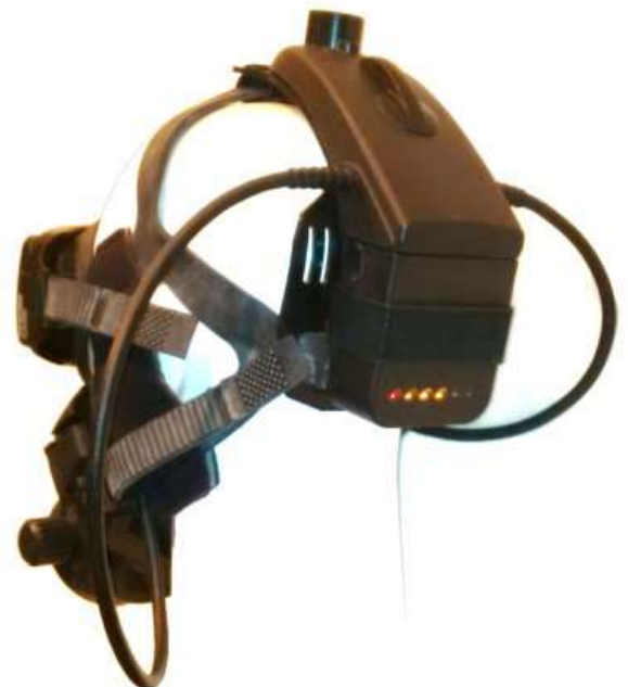
*Battery Pack with LED display for charge state